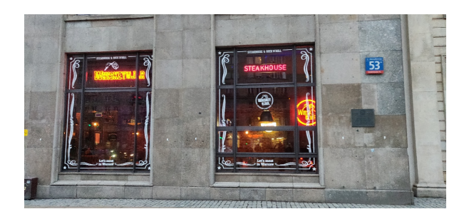
Figure 6: Steak house "Whistey in the Jar" (WiJ) from Marszalkowska Street.