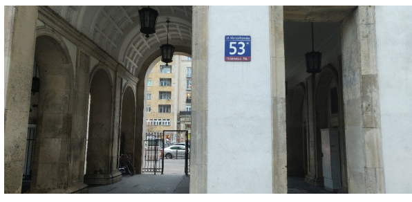
Figure 4: Board with building number from the courtyard.