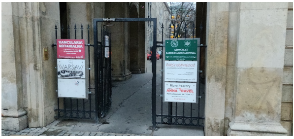
Figure 3: Entrance to the courtyard at Marszalkowska 53.

ground floor, so that I could see a notice board there, but again, no sign of PESA. There was also an intercom – I called the number 36 twice, but there was no answer."