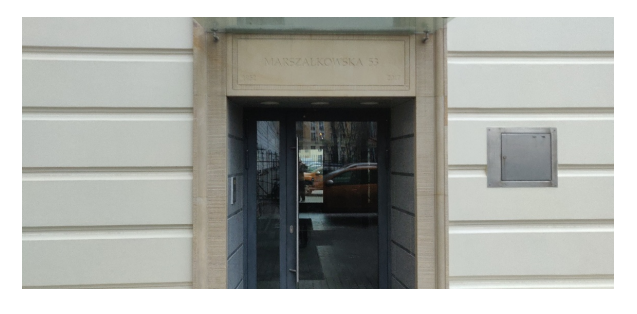
Figure 5: Entrance to the building from the courtyard.

The following gives a visual impression of the site. Figure 3 shows the entrance to the courtyard at Marszalkowska 53. Figure 4 shows the board with the building number from the courtyard. Figure 5