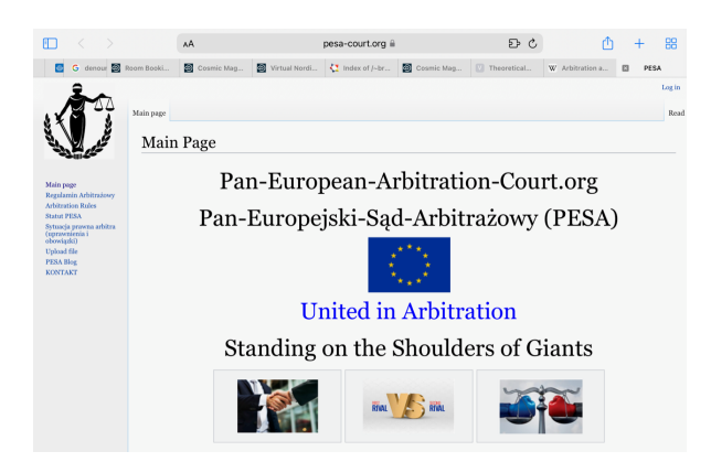
Figure 8: PESA Website.

Figures 6 and 7 show the street view consistent with google map shown in Figure 2. Thus, in conclusion, there is actually no way of contacting this court – no one at the address Marszałkowska 53, no phone.