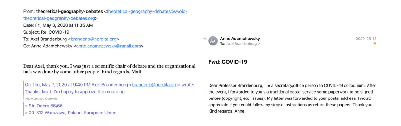
Figure 2: Evidence of usual, non-commercial communication: request to sign copyright (May 8 and 13).

Figure 1: Evidence of usual, non-commercial communication: First contact on April 8, 2020. Expression of interest. Reference to scientific organizing committee and University of Warsaw.